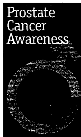
On May 28 the USPS issued the 33-cent Prostate Cancer Awareness stamp. Scott #3315

Your urologist has found a target area "below" called the perineum. In that little area he is able to find space for as many as 50 needles loaded with a low radiation "seed" (I-125 radioactive iodine.) With his skill he is able to implant some 150 of these seeds. You are now radioactive and will be well warned to avoid grandchildren and pregnant women. You also will have first call on the softest cushions in the house as it will be a delicate exercise to sit down for at least the next five days.