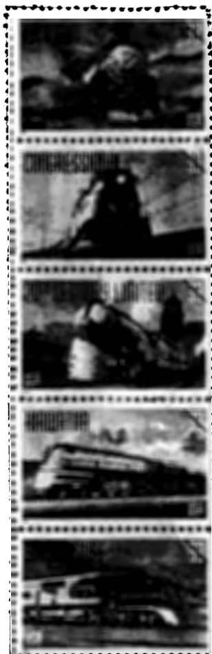
The Five “All Aboard!” Stamps Shown Top to Bottom in the Same Order as the Text

the Pennsylvania Railroad. It was pulled by a celebrated Class GG1 2C-C2 electric locomotive sporting a stainless steel outer shell.