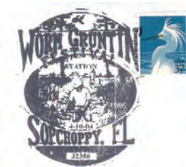
2004 Worm Gruntin' Cancellation from Sopchoppy, Florida