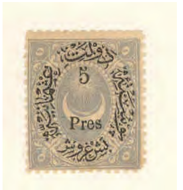
See if you can identify this stamp.

Identifier. It is a mandatory item in an serious collectors reference library yet it is inexpensive and easy to use. The beginning collector will find this book invaluable. The book contains a large alphabetic listing of stamp inscriptions, including Greek and Cyrillic listings and photos of difficult-to-identify stamps. This book can be found all over the internet. It is edited by Donna O'Keefe and the cost usually runs around $10.